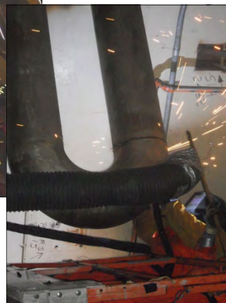
← Sean Corbett cutting a Reactor Coolant System Interference in Unit 2 Containment IMB (Inside Missile Barrier) in preparation for removal. Andrew Fitzgerald (not shown) performed fire watch duties.