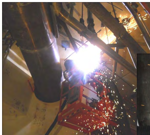
↑ Dennis Quinn cutting a Unit 2 Containment interference with Paul Keller performing fire watch duties.