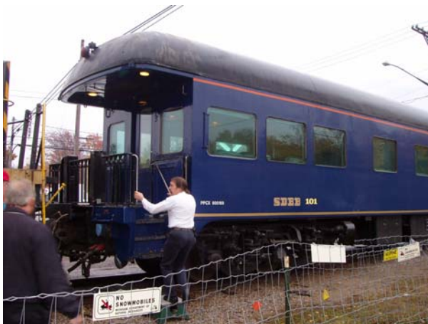
Ken and the Blue Ridge Business Car

Wow, we arrived and both the idler cars and the caboose were attached to the ETMX1001, the rail car loaded with the reactor, and my bike of course. The rail road guys (Lake State Railway Company, LSRC, who operate the rail road to Saginaw) advised that the engine and the Blue Ridge open platform business car were en route and should arrive around 09:00. This was great news a great start to the first day of this potentially very unusual and hopefully uneventful journey.