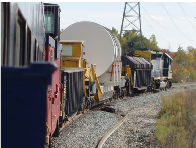
Around a curve in Ohio