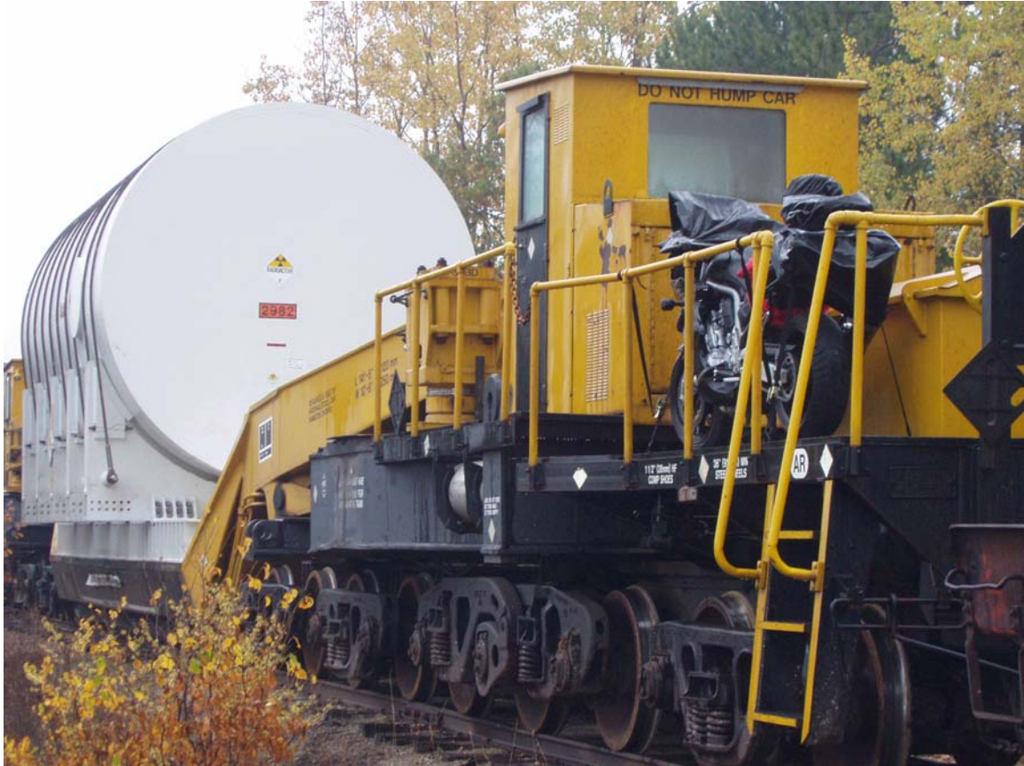
The FZ1, ETMX and the RVTS

Loading the FZ1, my Yamaha motorcycle, onto the ETMX1001 rail car (the special rail car loaded with the reactor), well done by the guys but still not a pretty sight when your pride and joy is hanging off the end of slings suspended 15 feet above terra firma. I tie the bike down with two strong straps, place some covers over the mirrors and muffler and return home.