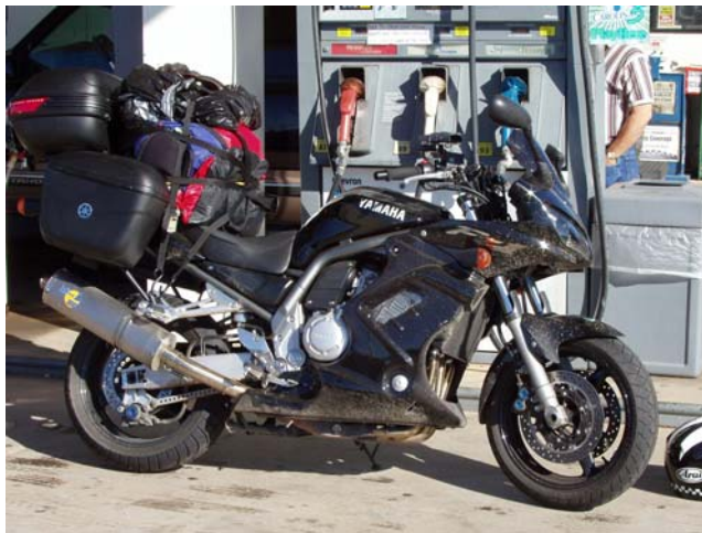
The FZ Loaded somewhere in SC