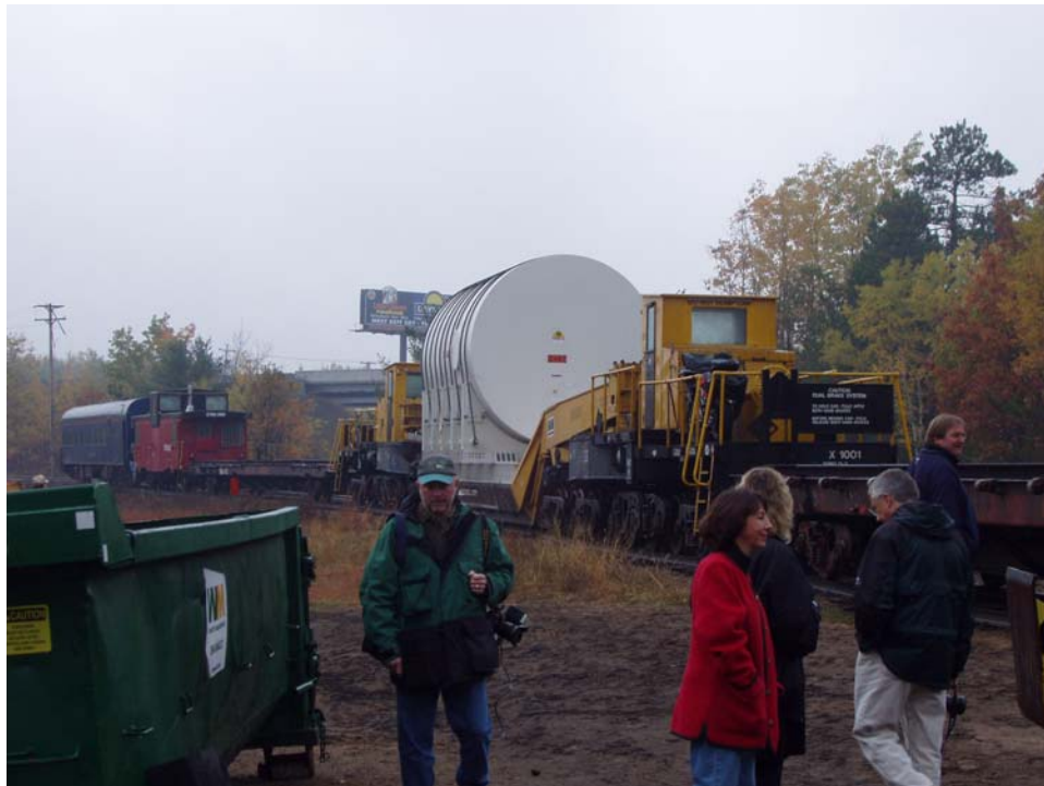
Happy Faces – Preparing to Leave the Gaylord Siding