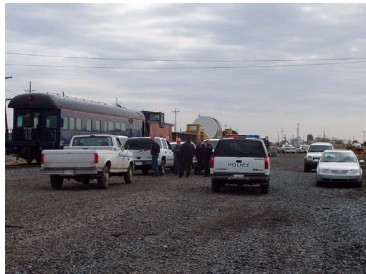
Law Enforcement et al