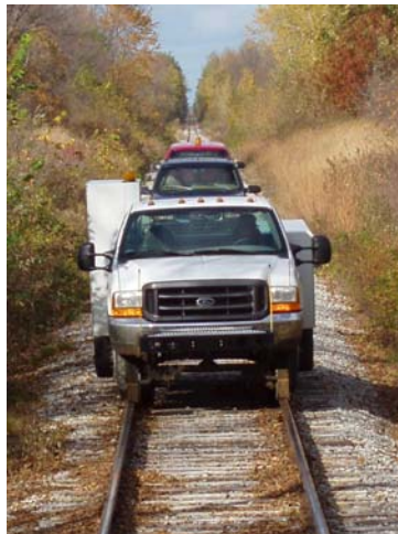
The 3 high-railers!

At 15:30 the route we are going to take comes up again! Virginia comes into the conversation, "Why are we going into Virginia?" the question is asked. We don't know it was just mentioned, lets wait till we stop and get the clearance paperwork from the locomotive engineer and stop second guessing is the agreed way forward. Crystal balls will be provided on the next trip – believe me. We pass mile marker 22, 4 more miles to go! The three high-rail cars escorting us from the rear must be sensing we're getting close, they're bunching together, almost time to relax.