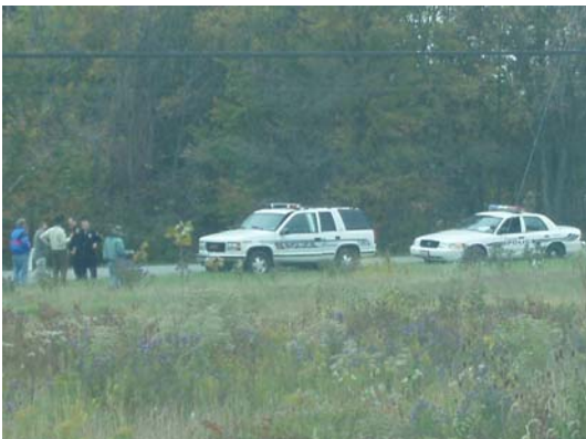
A little bit of action!

We have six protesters on the road adjacent to the rail yard with placards we cannot read. Photographs are being taken but the police presence is high. I give Tim a call to keep him informed.