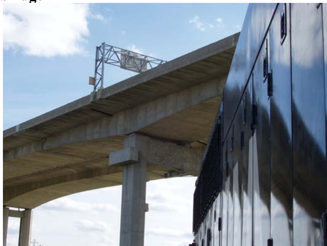
We're nearly underneath