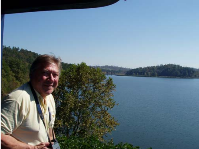
Crossing into SC over the Savannah