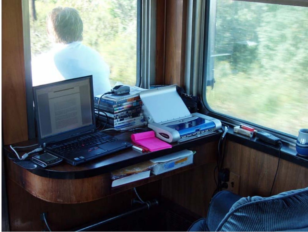
My traveling workstation – people would kill for a desk job like this