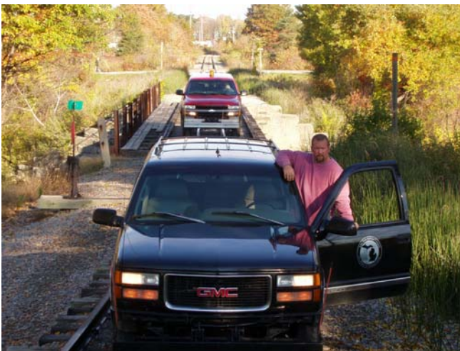
Crossing the Creek at Linwood

As we travel slowly past the southern Michigan plains, our speed has diminished to about 5 mph. Oh it seems so slow now, Weber strikes again! The sun is beating down until you go outside and phew, it's cold. Bill sheds another tear as we pass yet another golf course – so close but yet so far!