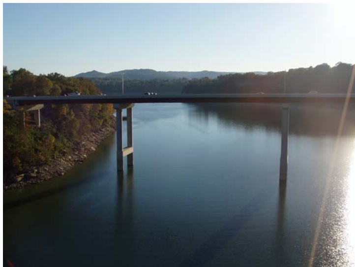
The Cumberland River, KY

It is 18:00 and we pass our conductors' home town of Tateville about 25 miles north of the Tennessee state line, we'll be in Tennessee by 19:00. As the sun starts to set we arrive 3 minutes ahead of schedule at 18:57. We all decide to eat and chat about things and nothings. I decide to have a microwave cheeseburger which tastes like the most beautiful thing I've eaten in months. Well, when you remember it's been 3 days since I've had a hot meal, anything would taste good. We stop at 21:00 and change crews again for the stint to Chattanooga. Greg is our new conductor. After we commence the journey we discuss the game plan and expect that we will be in Chattanooga at around 00:30 Monday morning and into Atlanta around 07:00. I call Tim and advise the schedule and that we have enough provisions to keep well until we reach Columbia, South Carolina. Tim and Bill are in Chattanooga and suggest that they travel to Columbia at their leisure. Tim says he will talk to Bill and call me back. Tim calls and, exactly as my expectation, Tim wants to rejoin the train at some stage. We agree that I will call him when we get close to Atlanta and arrange a location to pick him up. Its 21:10 and I check my voice mails, 9 of them, phew. I start to call Pat and he rings me, he is very happy about things and is currently in Richland, Washington state.