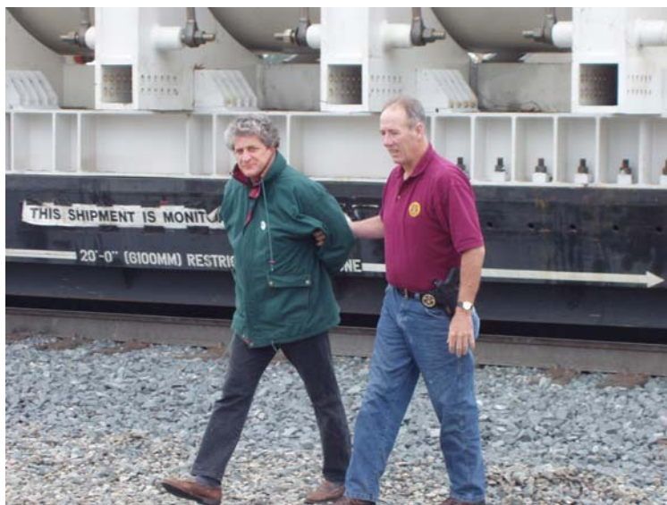
My new friend