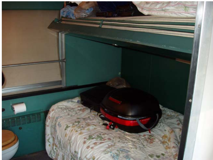
My palatial boudoirs, note ON suite!

Back to the rail car for 21:50, relieved Tim and phoned home. Got Piri's math problem ready for tomorrow so will focus on that first thing but it's quite straight forward, something to do with license plates and the arrangement of the letters and the numbers. Not much later I call it quits.