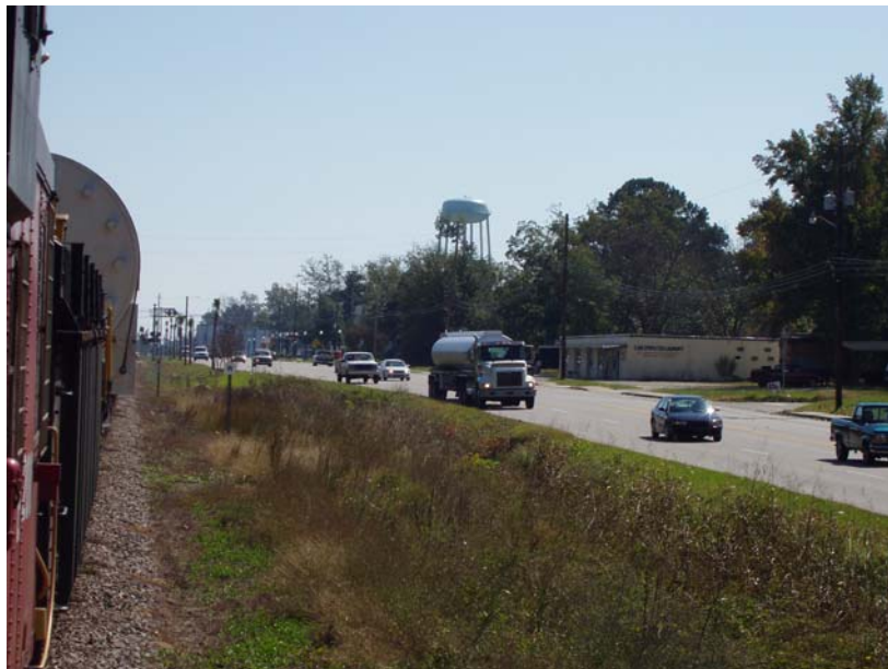
A gas tanker in unison with the 'device' what is wrong with this picture, nothing!