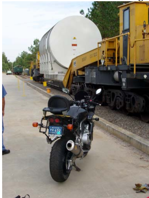
The FZ on Terra Firma after 8 days!