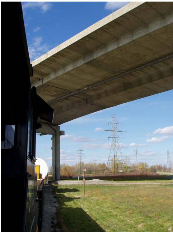
The Package is underneath it