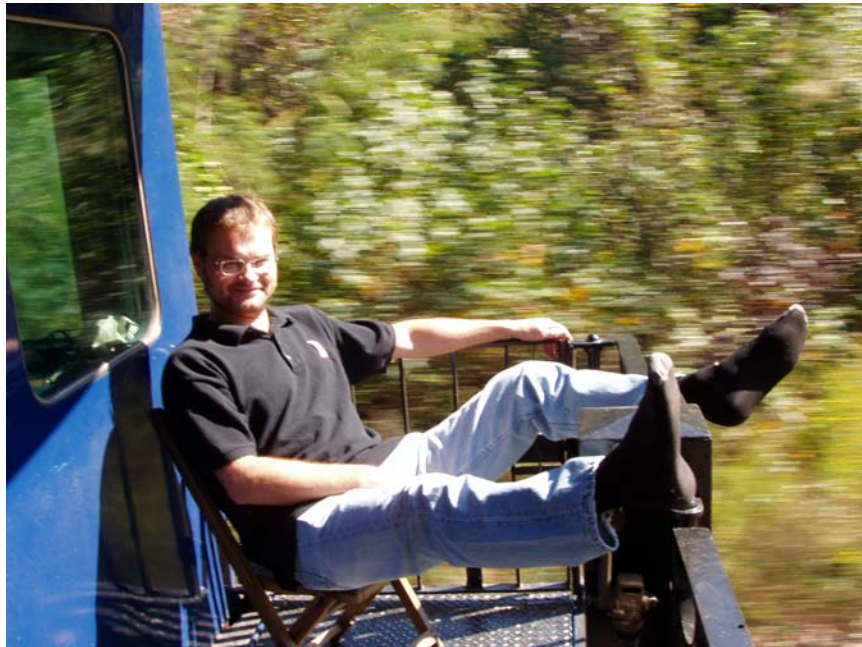
I know it's a cliché but 'It's good to be me'