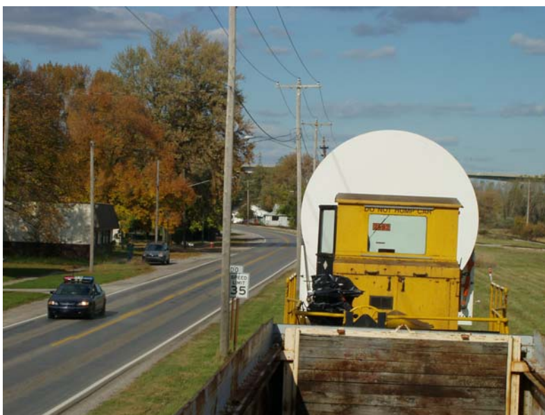
Law Enforcement Officer 'LEO' interest