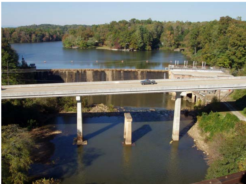
Entering Greenville SC