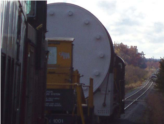
Negotiating a bend at Hudson Creek