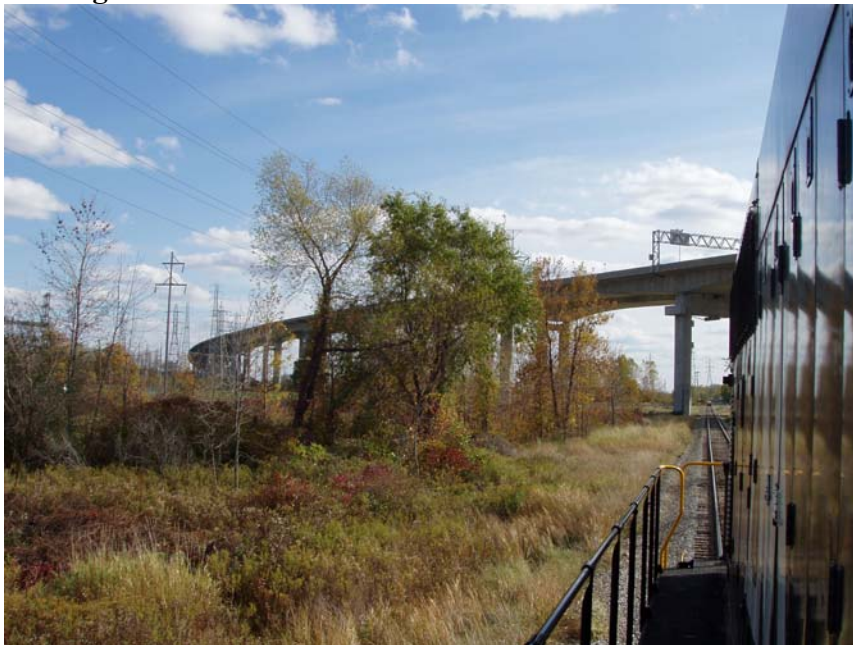
We approach the Zilwaukee (I75) bridge