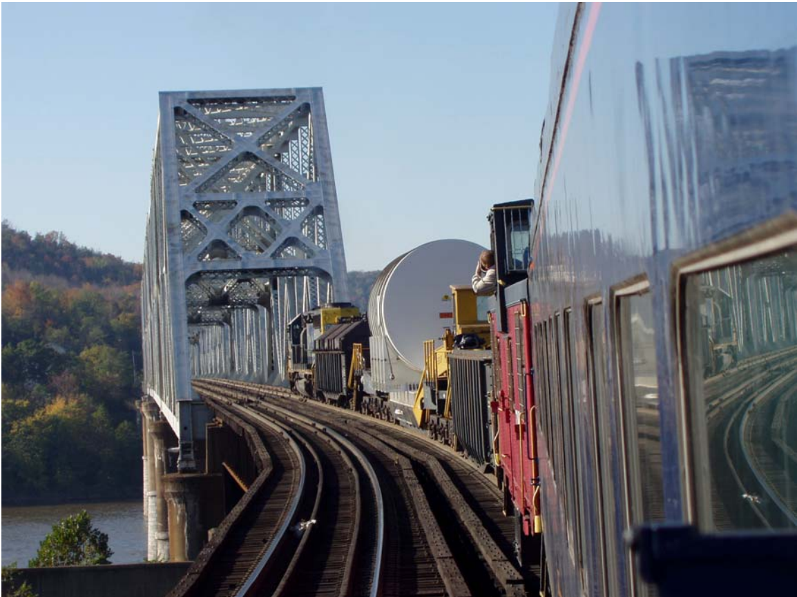
We're on the Bridge