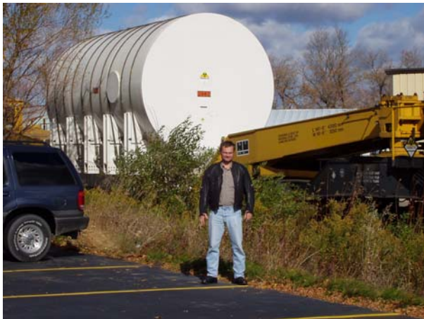
Me at the lunch break and ‘load check’