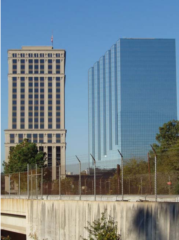
Views from the south side of Atlanta