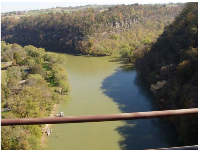
200' above the Kentucky River

We stop at Danville at 15:20 and change crews out, complete my inspections and all is okay. Bill swaps with Dave to drive and Tim agrees to stay on the van. We load with provisions and we go at 15:36.