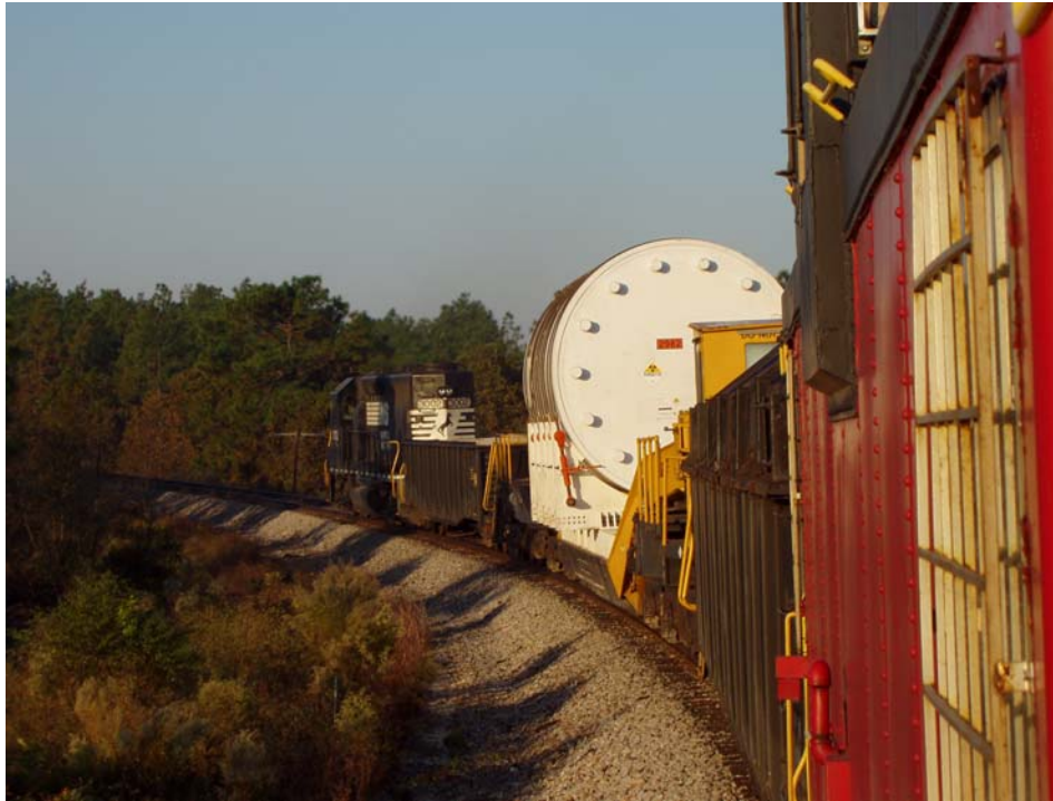
On the way to Barnwell, South Carolina

We commence the journey again at 07:57. There is now a build up of vehicles at the crossing we have been blocking for the last 3 minutes. This must have seemed a long time to these poor people who are probably now late for work thanks to us – sorry.