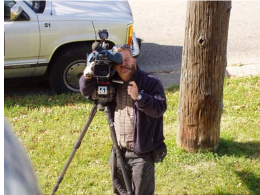
Me taking a picture of the TV5 cameraman taking video of me at a Bay City rail crossing