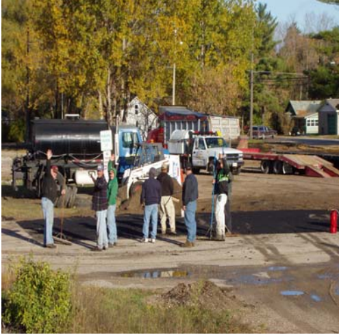
The road crew at Roscommon

(Oldfield is only 5 years older than me) thirty two albums and four concerts I have the pleasure of attending, later Oldfield does things to my mind that nothing or no one else ever has and maybe ever will. We arrive at Roscommon at 09:30 to a lot of happy people, just see the picture below. Where's next? Well it's St Helens, not the famous rugby league club but it might as well be.