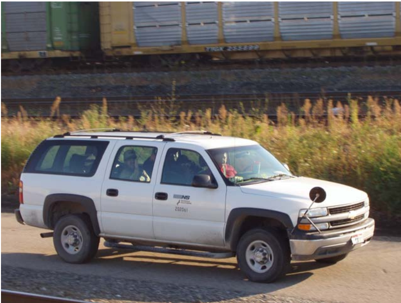
Our friendly NS Crew