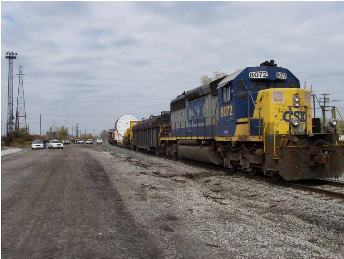
The CSXT Power Unit at Toledo Rail Yard