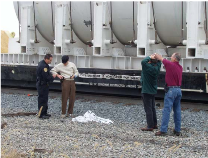
The arrest, 10:45

If I don't hear anything by 11:00 I'm going to commence my next round of phone calls to get the politicians involved.